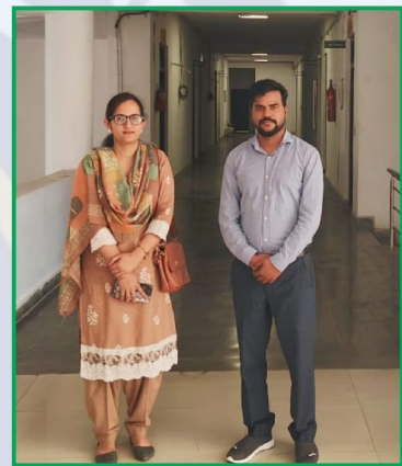
Visited IIT Delhi and India Accelerator for capacity building on 30th-31st May 2024