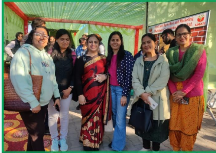
Participated in Stakeholder Consultation at Unati, Talwara by PSCST on 23rd Feb 2024